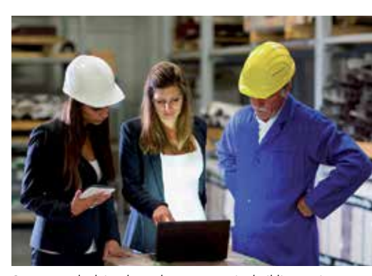
Support and advice throughout your entire building project