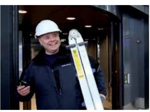
Regular maintenance optimizes your entrance performance