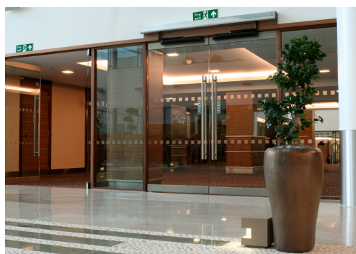
Beautifully installed at Sofitel Hotel, Heathrow, UK