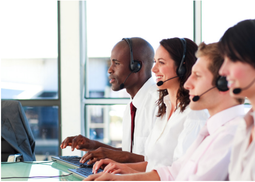
Support and advise through-out your entire building project