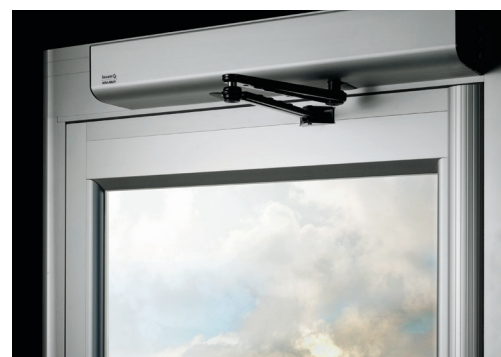
Can be retrofitted to existing manual and automated doors

ASSA ABLOY Entrance Systems provide automatic swing doors for both interior and exterior environments. An automatic swing door system requires a minimum of space while providing a maximum of clear opening width.