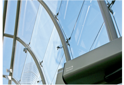
Self-adjusting closing force