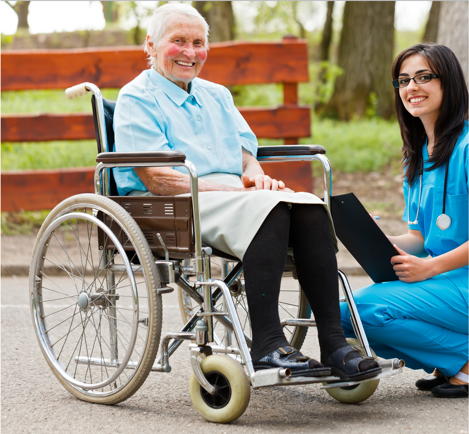
© ASSA ABLOY Entrance Systems AB BR.SW 100/GRB.EN-2.0/1409 Technical data subject to change without notice.