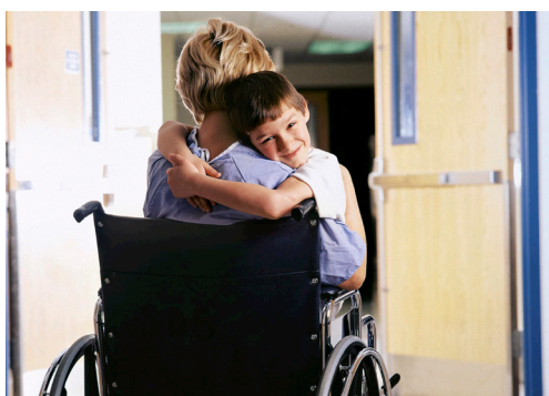
Ideal for healthcare and residential applications